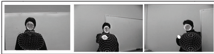
An example of gesture recognition using multiple cameras.

Tools and model-based design also provide high-confidence implementations in the face of complex algorithms that must meet multiple implementation goals. Model-based design refers to the design of applications using components that have well-defined behavior and interact through well-defined models of computation. By software synthesis, researchers mean the automated derivation of software implementations from model-based representations. Model-based design is used widely for algorithm development and simulation of one-dimensional signal processing applications, such as those used in speech/audio processing and wireless communication. However, its use for software synthesis and video applications is limited by the expressive power of existing model-based DSP design tools. Such design tools do not adequately support control flow and multidimensional DSP operations. As a result, engineers are typically forced to use model-based design tools for early, subsystem-level algorithm exploration, and then manually develop and integrate the subsystem-level implementations for the final production code. This leads to inconsistencies between the model-based specifications and the production code, which is error-prone and negates useful properties, such as bounded memory, deadlock avoidance, and local synchrony qualities, that are offered by the model-based specifications. ☺