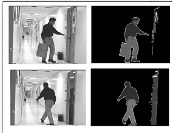
Researchers will use fingerprinting algorithms to track a person acquiring or disposing of an object, like a briefcase.